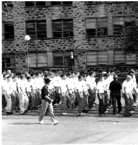
One County learning how to march.

The counselors present another problem. Do they really know what they're doing? To this journalist it seems that many of them do more screaming than actually teaching. Boys' State is a learning experience, but the teachers may not