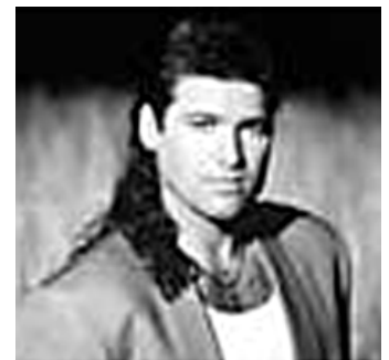
Billy Ray Cyrus: Sporting a Classic Tennessee Top Hat