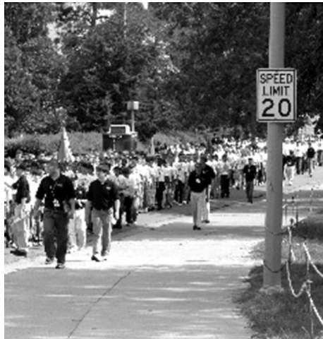
The entire camp marching to McCain.

be teaching the Staters the proper information. Some of the counselors cannot even keep a beat and a steady cadence going. Perfect. That's just what we need to march well, right?