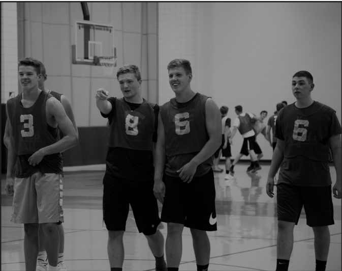
STATERS hit the court in between sessions.

A very unique factor for this case is how it creates a possible conflict of interest in young staters; one side being the law, and another being based off of how many delegates here may also be from rural communities. Cases like these at Boys State are very interesting and important as it allows young thinkers and shakers in our community to plan and create ideas to help solve issues in the future.