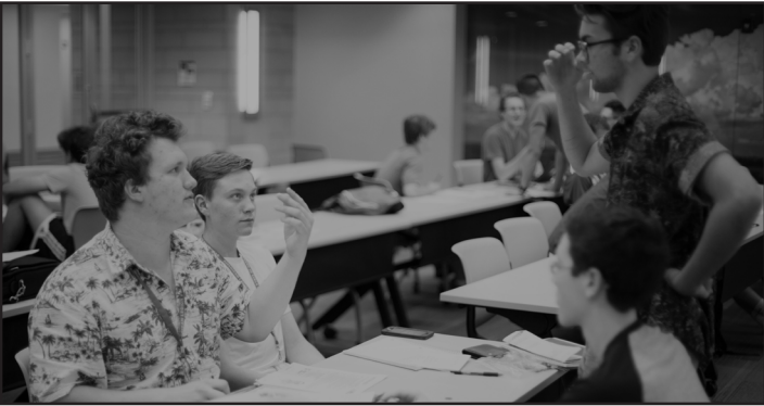
STATERS in their natural habitat: government.