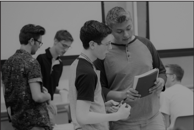
STATERS consult in the legislature.