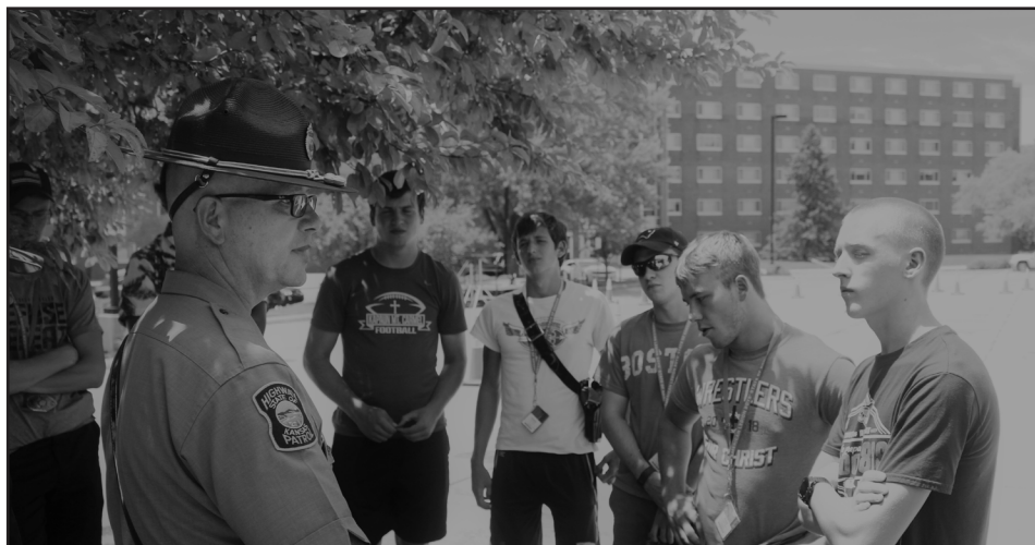
STATERS learn proper discipline from law enforcement volunteers.

The patrolman then stated that the suspect fell on the ground and proceeded to film the officer and yell that the officer had pushed him.