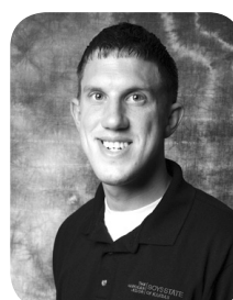
Tag Wall Personnel