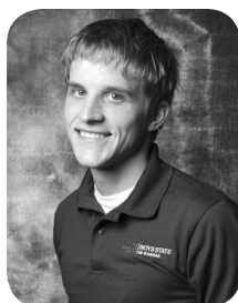
Matthew Root Curriculum