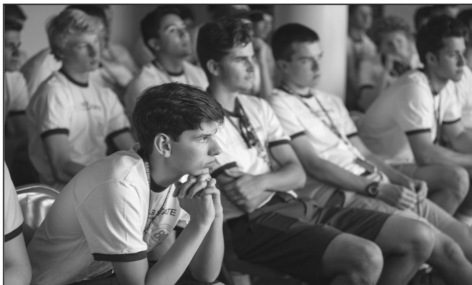
STATERS arrive on their county floors, ready for the week ahead.

from Bradley County stated that candidates from their party can be seen promoting democratization, a form of government where representatives will favor the general workers instead of interest groups. Other interests of the Nationalist Party include improving education, the environment, and the economy, as well as reducing crime and government corruption. Nationalist