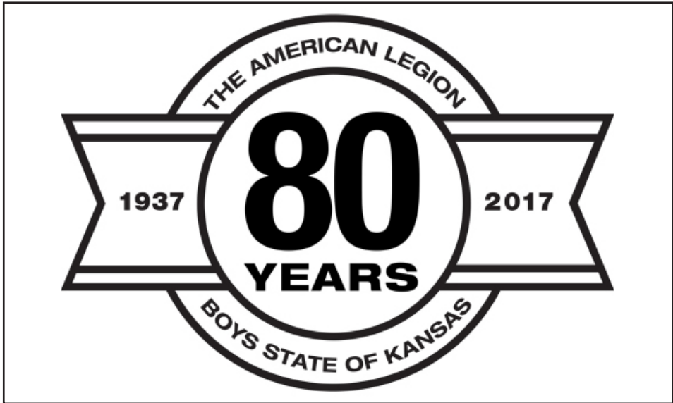
PROGRAM LOGO THE 80TH ANNIVERSARY LOGO FOR KANSAS BOYS STATE.

Among other things, they can set taxes, hire police and educators, and