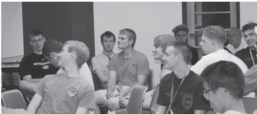
Staff Photo - Boys State counselors before Staters arrive during a training session